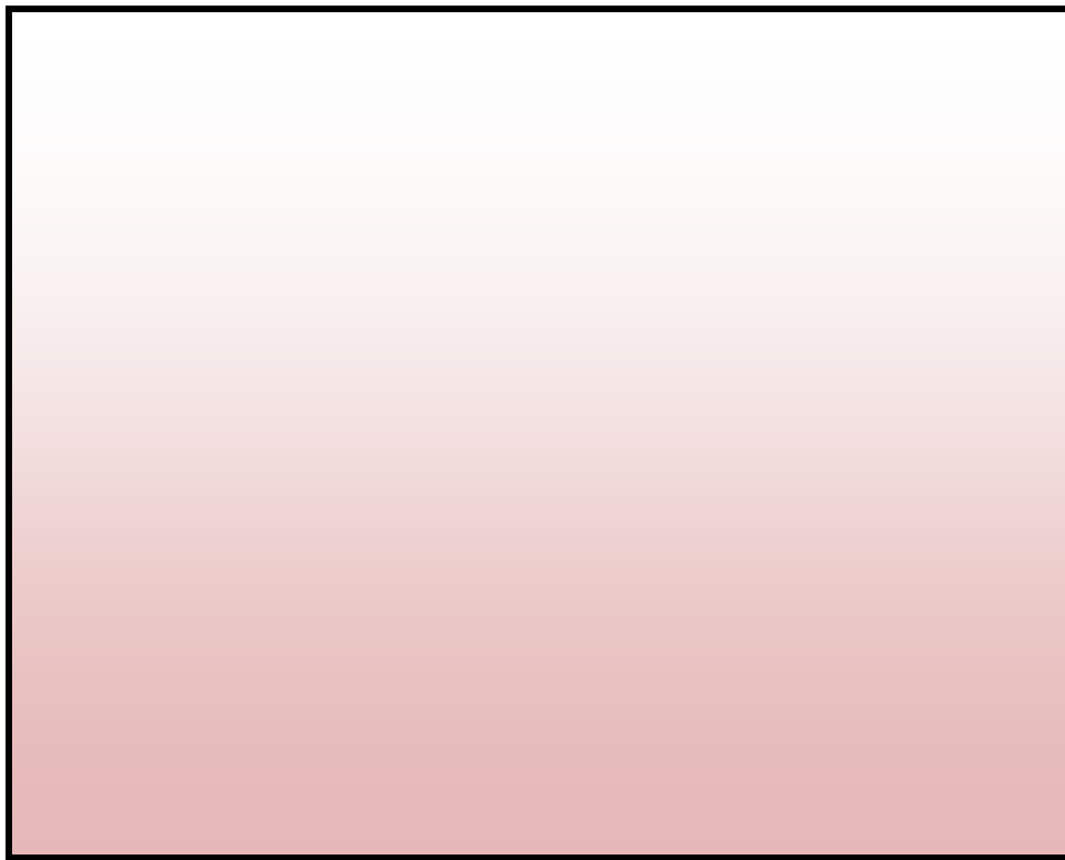
4" x 2.5" Quarter Page Vertical Ad Size